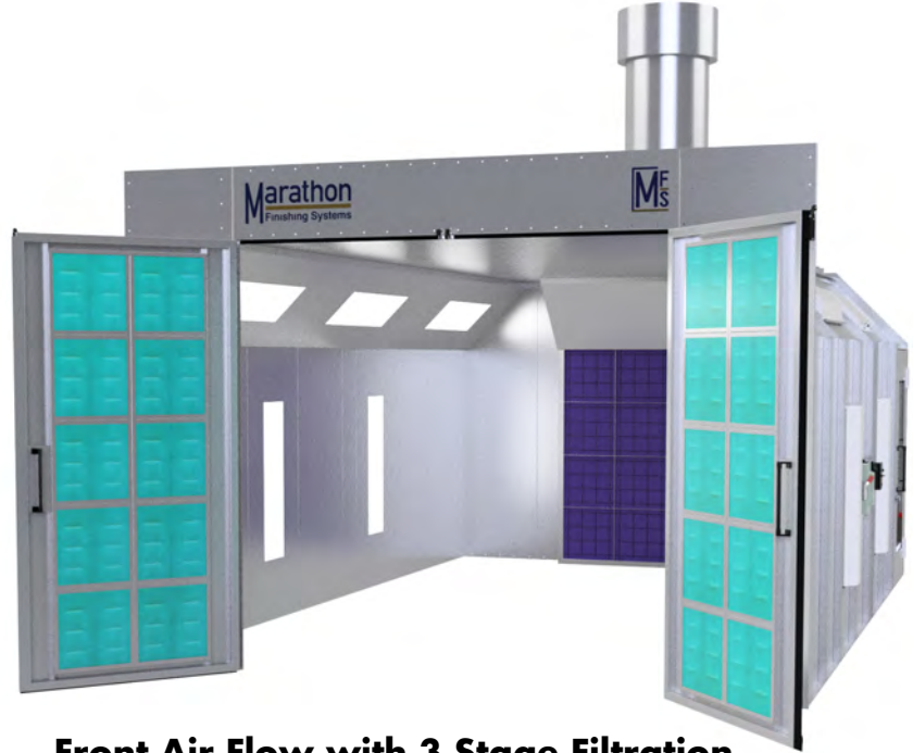
Front Air Flow with 3 Stage Filtration