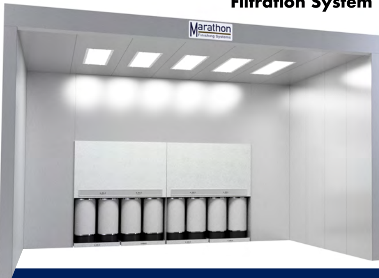
Open Face with Cartridge Filtration System