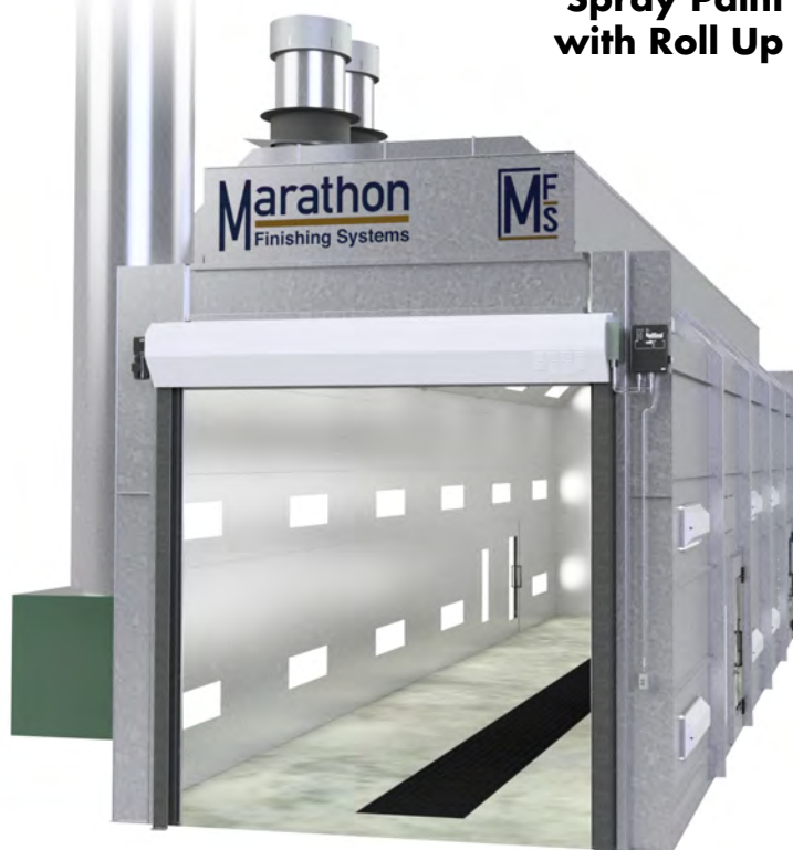
Heated Full Down Draft Spray Paint Booth with Roll Up Doors