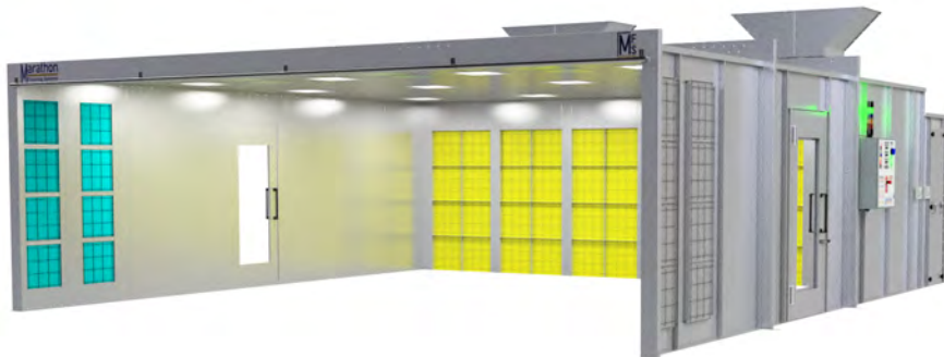
Industrial Open Face Spray Paint Booth with curtain (not shown for clarity)

The Industrial Open Face spray paint booths are perhaps one of the most popular booth types, largely due to it's simple design and easy operation. Marathon will modify our standard models to conform to your specific production requirements. Specialized configurations, including (but not limited to) crane slots, pass-through (for conveyor systems), custom filtration options, specialized facility modifications, integration into pre-existing or third party automated environments, and so much more!