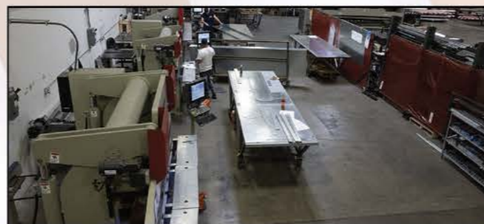
Our Press Brake department.