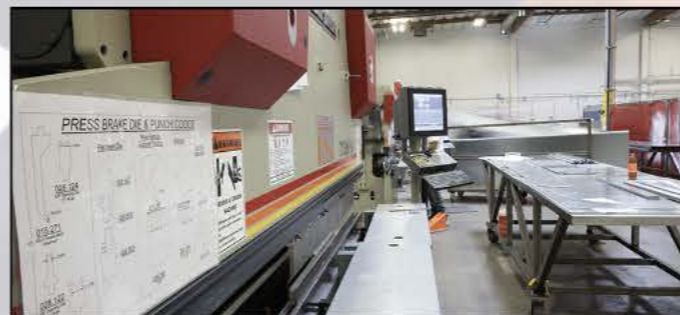
One of our CNC Multi-Axis Press Brakes.