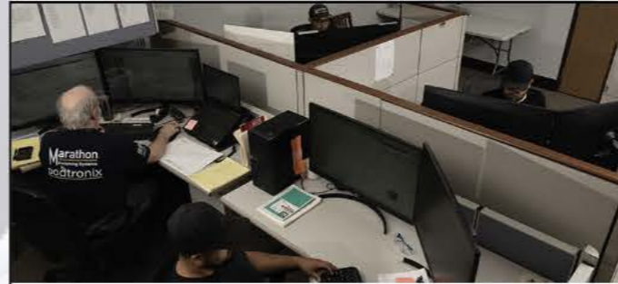
Our in-house fully staffed engineering department is ready to design according to your needs.

Marathon Finishing Systems is proud to support and employ people and businesses of North America. From Mexico to Canada, our 100% U.S.A. made products are complemented by quality materials and services from across our continent.