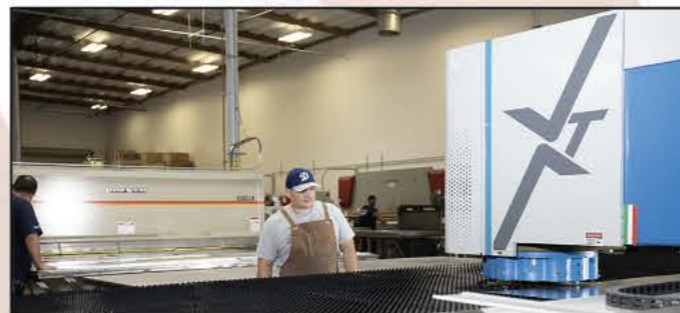
One of our CNC punch presses.

Call us today at 310 791-5601 to get started! www.MarathonFinishing.com • info@MarathonFinishing.com